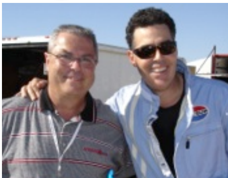
Hanging out “post interview” with Adam Carolla at the Coronado Speed Festival

Based on the overwhelming response to our pilot run, from both live and internet audiences, we know that there is a thriving, attractive, affluent demographic ready to become a loyal audience to “It’s All About The Car.”