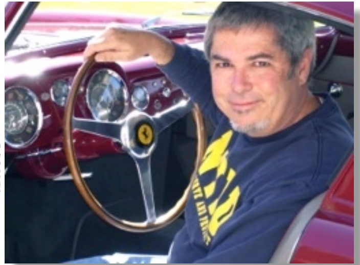
Behind the wheel of a 1960 Ferrari 250 GT