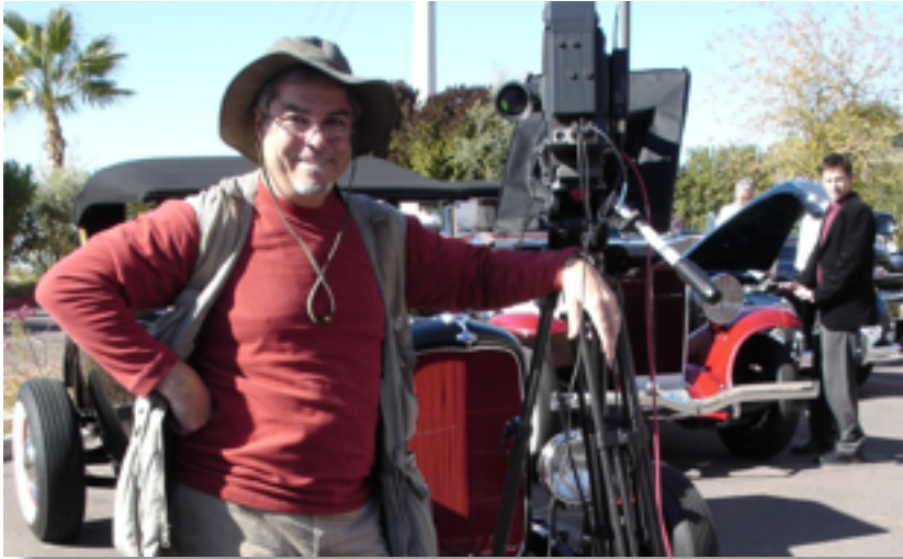
On set with Tanner Foust, host of the RM Classic Car Auction.